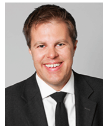
Greg Davies Call: 2005